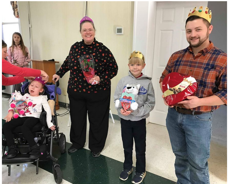
Souper Bowl Sunday