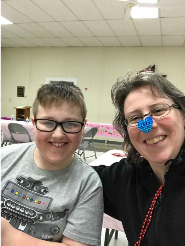
Parents Night Out