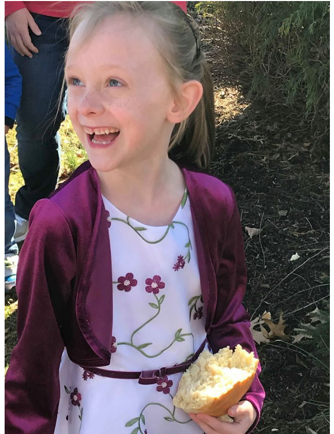
Holy Communion Sunday