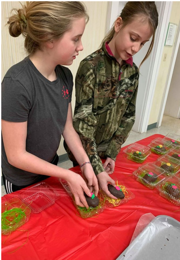
Making Peanut Butter Eggs