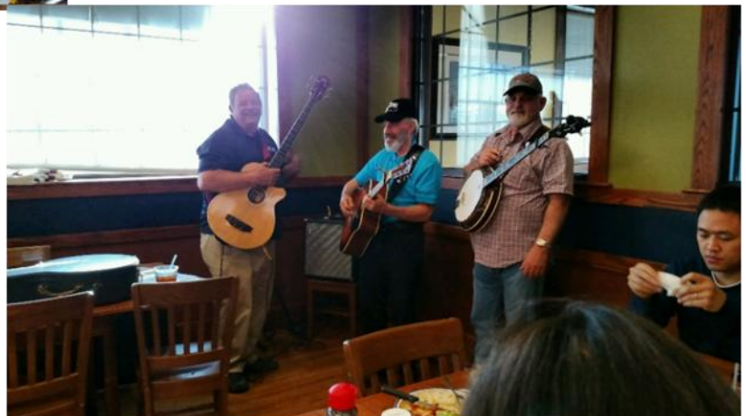
Ladies Night Out sponsored by UMM at Wood Grill. Entertainment by Tri County Line