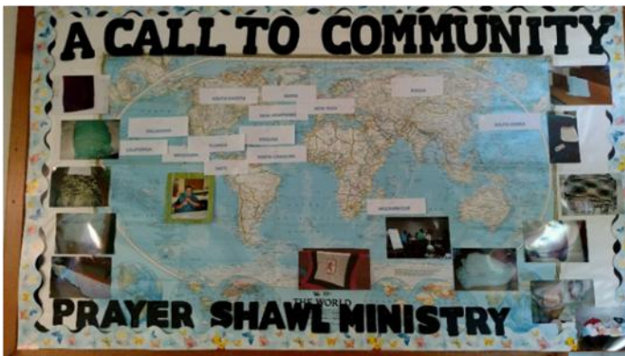
Prayer Shawl Ministry Shared around the World

New Business: With Vacation Bible School next month, the Church Council meeting is changed to 6:30 pm on Thursday, June 15.