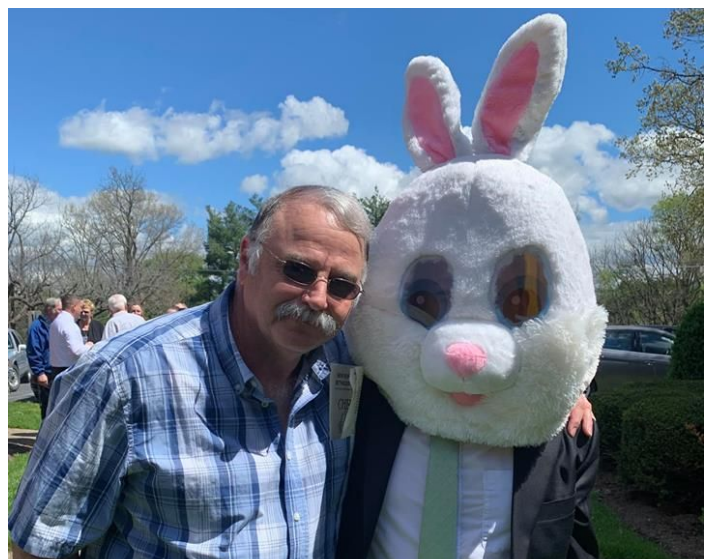
The Easter Bunny visited New Hope UMC