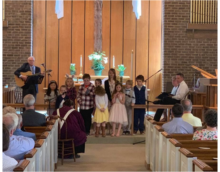
The children singing in the Easter Cantata