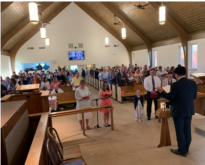
5 people joined, were baptized & confirmed