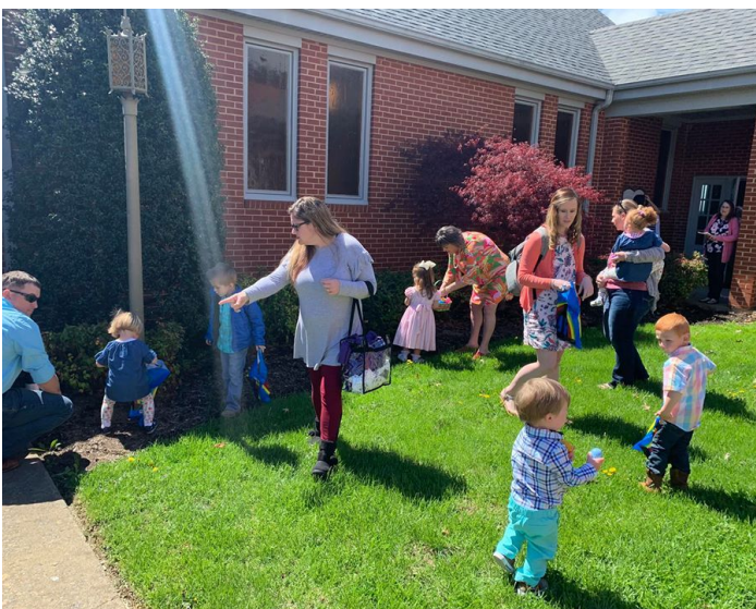
Easter Egg Hunt 2019