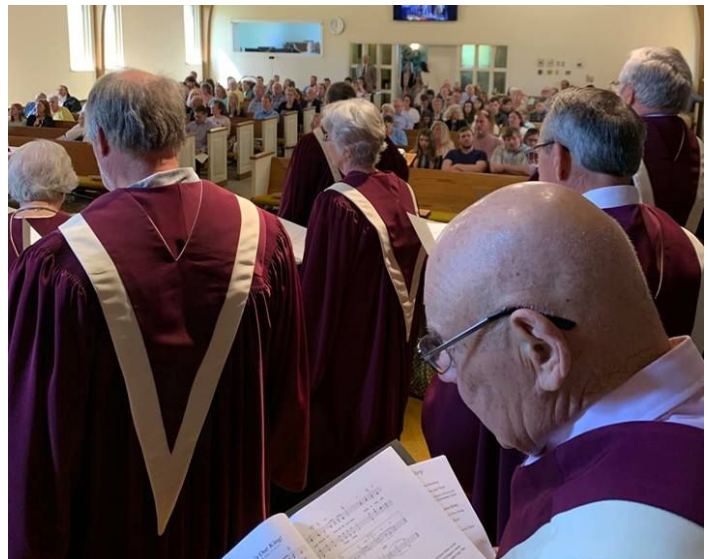
POV of the choir singing during the Cantata