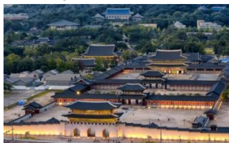
Old palace, traditional figures