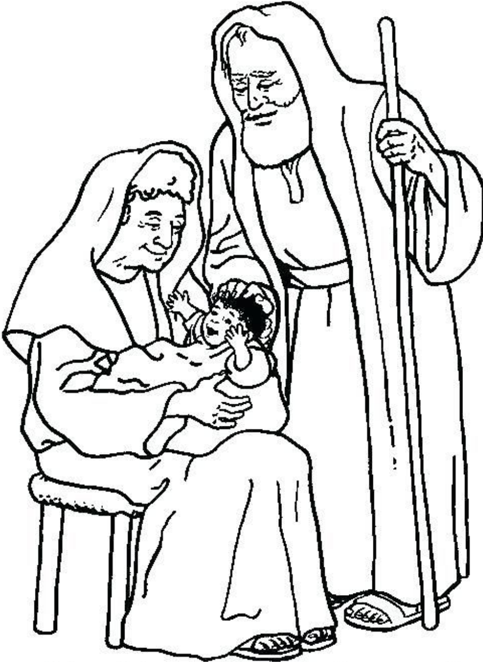
God gave Abraham and Sarah a son when they were very old.

Once there was a man named Abram. One day the Lord came to talk to Abram, and Abram asked, "Who will have all my things when I die". God promised Abram and his wife Sarai that one day they would be parents, even though they were old and had no children. God wasn't sure that Abram understood. So that night He took him outside, and said, "Do you see all the stars that are in the sky"? When Abram looked up, the whole night sky was full of stars, so many in fact that he would never be able to count them. Then God said, "That is how many children you will have". Quite a few years later when Abram was ninety-nine years old (older than even your grandparents) the Lord decided to change Abram's name to Abraham, which means "father of many." He also changed Sarai's name to Sarah. God told them again that they would be parents and that they would have a boy. This time Abraham laughed so hard he fell on his face! It was hard to believe that he and Sarah would have a child in their old age. One day three visitors came to Abraham's house. He hurried to meet them. "May I get you something to eat and drink?" Abraham asked. "Please come in and join us, and have a rest on the couch." The visitors agreed, so Abraham brought them some fresh