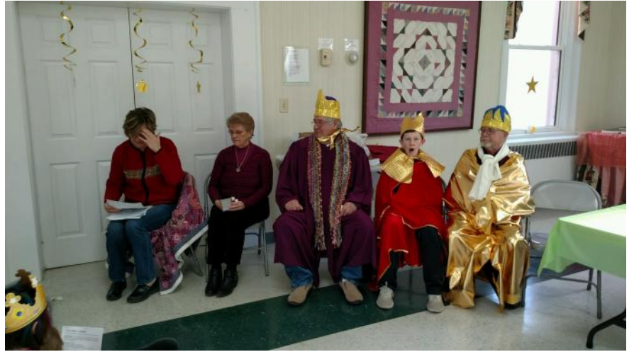
Celebrating Epiphany Could these be “junior Magi”?