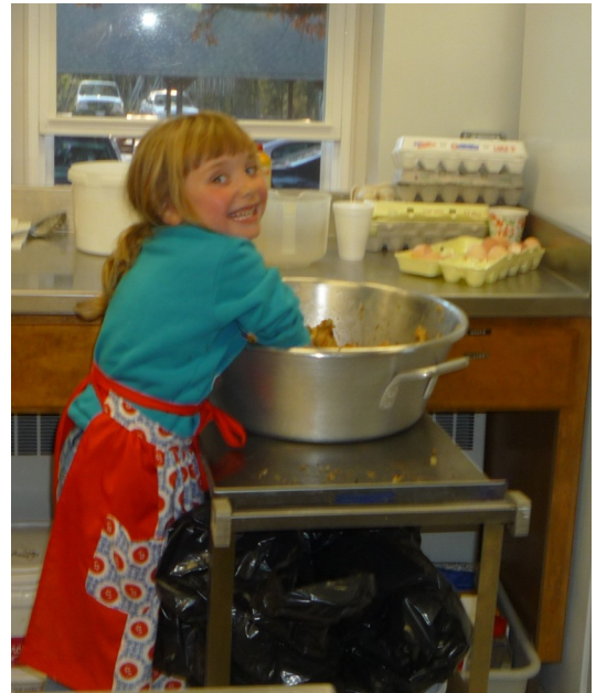
One of our younger members learning in the kitchen