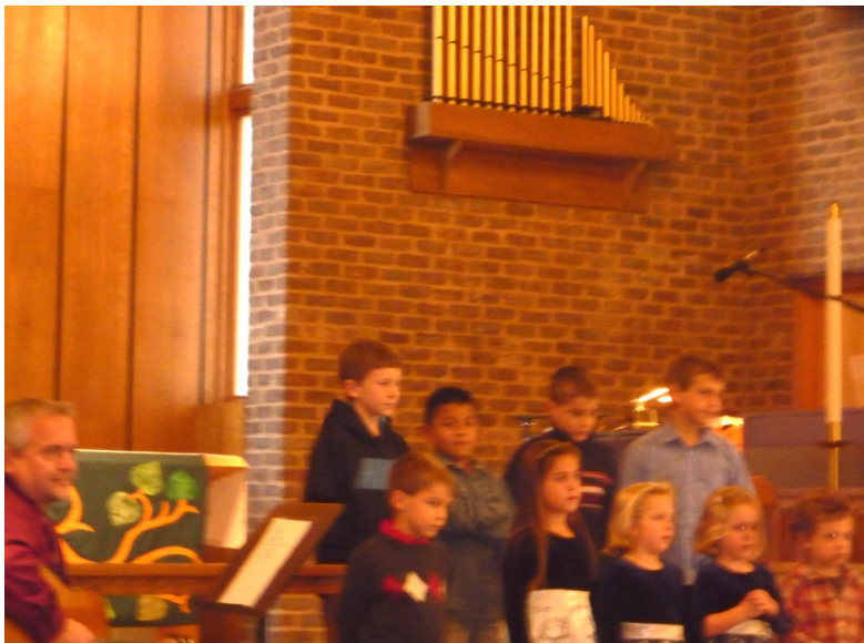
Children's Choir: Give Thanks